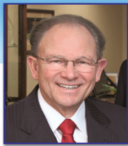
CA Insurance Lic. #0B38656

Securities and advisory services offered through FSC Securities Corporation, member FINRA/SIPC. Additional advisory services offered through The Retirement Group, LLC. Insurance offered through Bruce Formes Retirement Planning, LLC. All listed entities are unaffiliated.